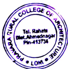
PRINCIPAL Pravara Rural College of Architecture, Loni