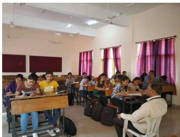
Students learning Skills of Personality Development